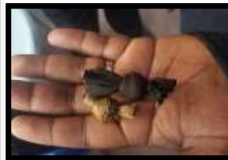
Charms to be burned publicly as in Acts 19.