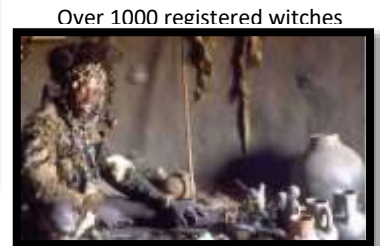
Over 1000 registered witches

YOU CAN HELP by paperback Bibles in Swahili $4 each and tracts $200 with "Get Help" contact info to be given door-to-door and on visits.