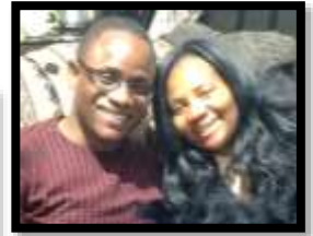
Hosts and translators.

YOU CAN HELP by Pastor's Support $100/mo, Pastor Seminary $600, Speakers $450, Projector $375, Tent for church building $4,000, Pastor ministry vehicle $ 5,000