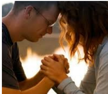
PRAY TOGETHER AND CONSIDER...

So together with you, we will do this! Ask Him, your Master, what has He entrusted you with as far as