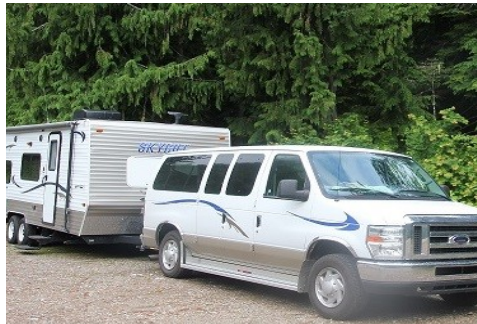
HOPE Response Travel Trailer and Van

If God has given you the means to help in any of these ways....we would be grateful!