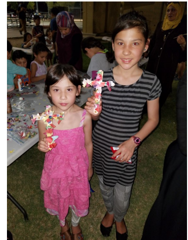
The Call of the Cross

Small breakout groups each night resulted in great questions and discussion of the life of Jesus. In an effort to keep these talks going towards worldview change and a relationship with Christ we have begun apartment gatherings for "English and the Word of God." We wrote a 12 week Hope Response language learning tool. It is for everyday skills that they need and uses a Bible story for the English narrative. GCU students help in practice time break out groups.