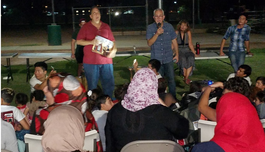
Refugee VBS Outreach Week— July 23-28, 2017