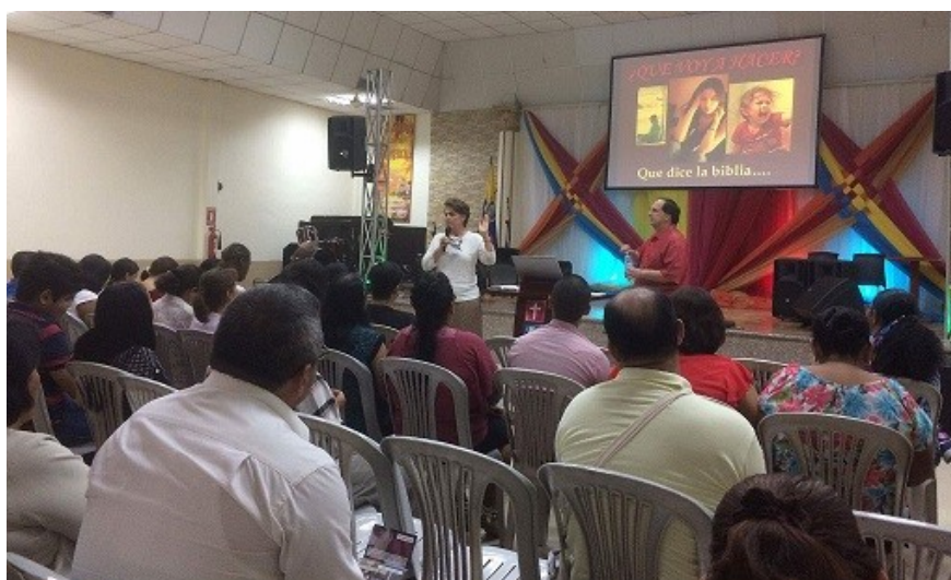
HOPE Responders Training for sharing Christ in times of Loss, Pain and Grief

came in drunk once again. He said 'of course' to which his son said 'then go to church with me!' He did and the message he heard felt as though God were speaking direct to him. He gave his life to Christ!